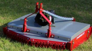
SB-100 / 120