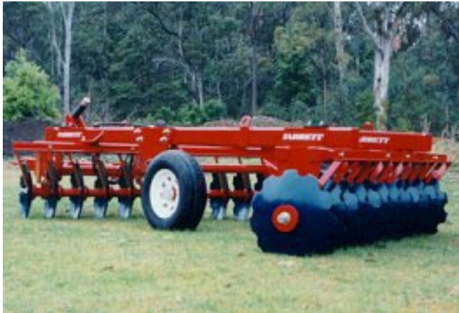
The JT2426 (24 disc) trailing disc cultivator (rear view)