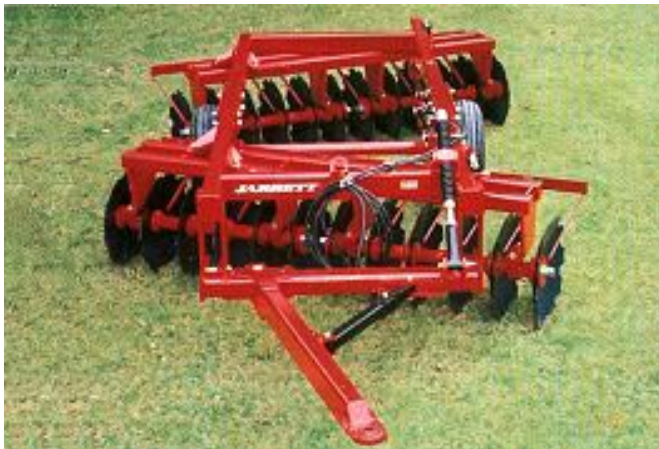
The JT2426 (24 disc) trailing disc cultivator (front view)