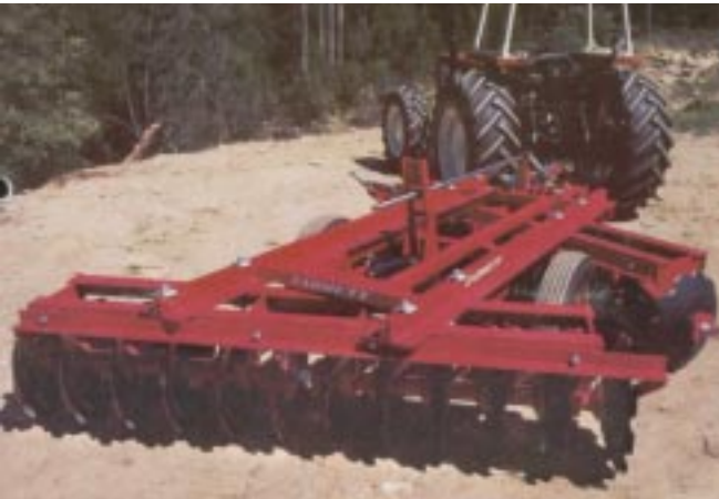
The TD2424 (24 disc) trailing disc cultivator (rear view)