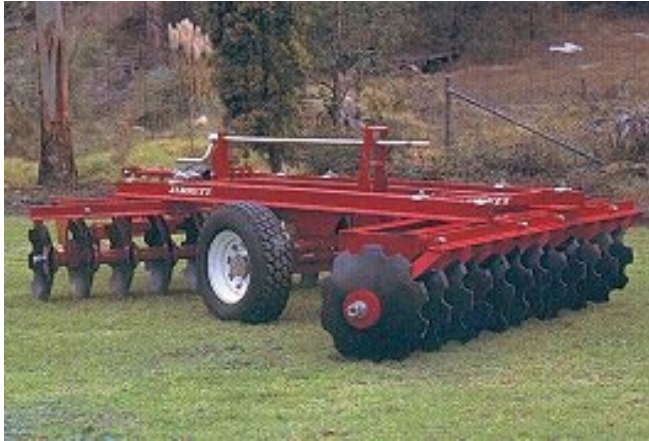
The TD2424 (24 disc) trailing disc cultivator (side view)